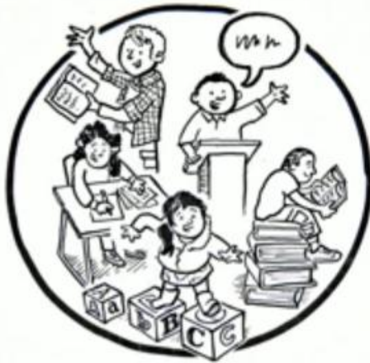
ENGLISH LANGUAGE ARTS